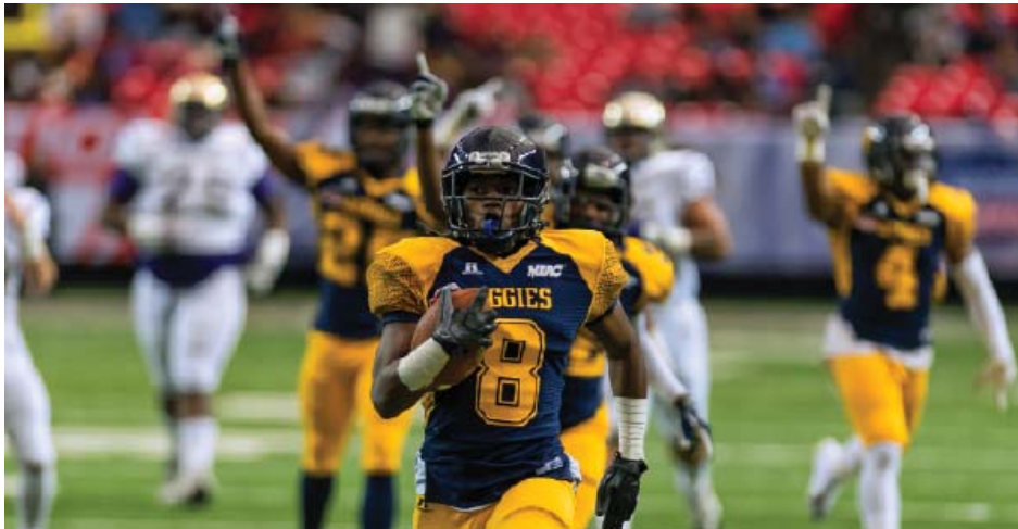
THE AGGIES ALL-AMERICAN PUNT RETURNER