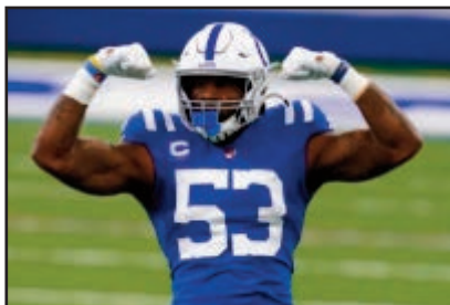
Darius Leonard-LB Indianapolis Colts