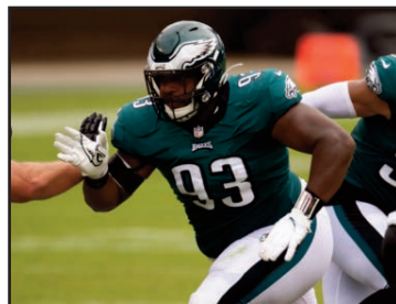
Javon Hargrave-NT Philadelphia Eagles